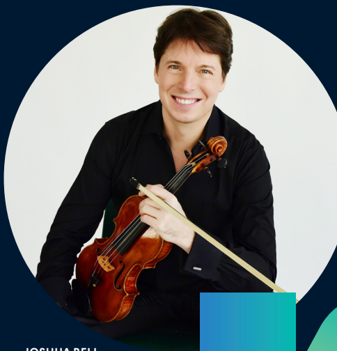
JOSHUA BELL July 13 / 14

ASPEN MUSIC FESTIVAL AND SCHOOL 75th Anniversary