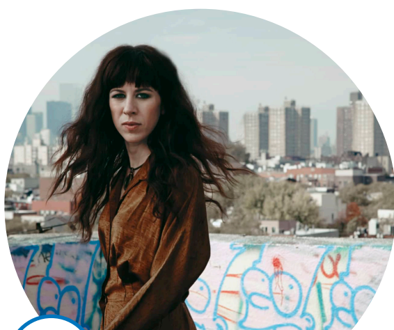
MISSY MAZZOLI July 24

A Recital by Paul Jacobs organ (Free) Aspen Community Church J. S. BACH: Prelude and Fugue in D major, BWV 532 Organ Trio Sonata No. 4 in E minor, BWV 528 Prelude and Fugue in A minor, BWV 543 Arioso from Cantata, BWV 156 LISZT: Fantasie and Fugue on the Chorale 'Ad nos, ad salutarem undam'