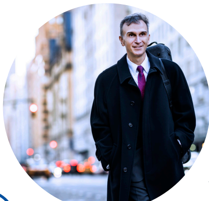
GIL SHAHAM July 25 / August 2