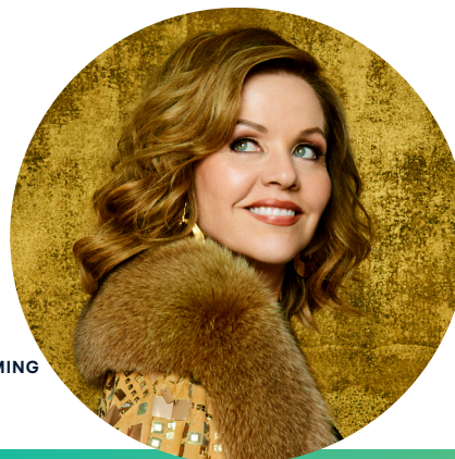
RENÉE FLEMING June 30

R. SCHUMANN: Symphony No. 4 in D minor, op. 120