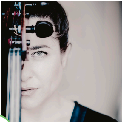
ALISA WEILERSTEIN A