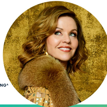
RENÉE FLEMING A

— CHRIS THILE: ATTENTION! A narrative song cycle for extroverted mandolin and orchestra.