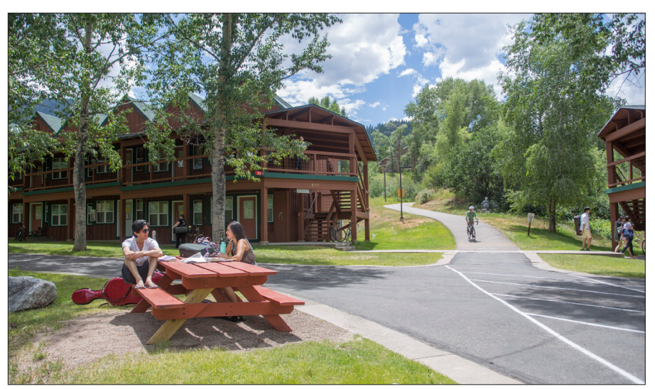
AMFS students at Marolt Ranch