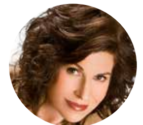
SHARON ISBIN August 6

WAGNER: Prelude and Liebestod from Tristan und Isolde SKRYABIN: The Poem of Ecstasy , op. 54 Program performed with intermission.