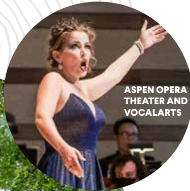
ASPEN OPERA THEATER AND VOCALARTS