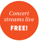
AUGUSTIN HADELICH July 31

Free livestream at aspenmusicfestival.com