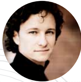
MARTIN HELMCHEN July 20