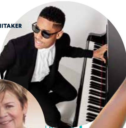
MATTHEW WHITAKER July 1, 2