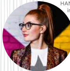
JESS GILLAM July 13, 14, 16

VARIOUS: Le Monde Galant: A Suite of Baroque Music from Around the World