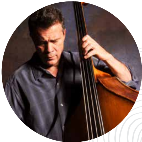
EDGAR MEYER WITH BELA FLECK AND MIKE MARSHALL July 30