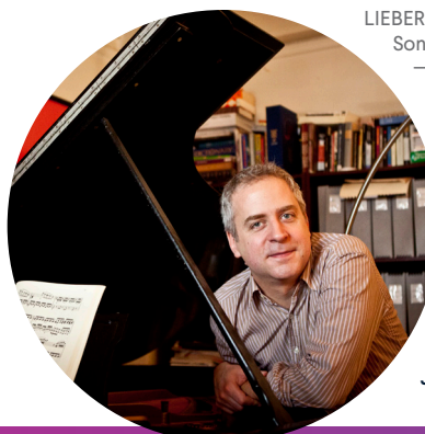
JEREMY DENK ▲