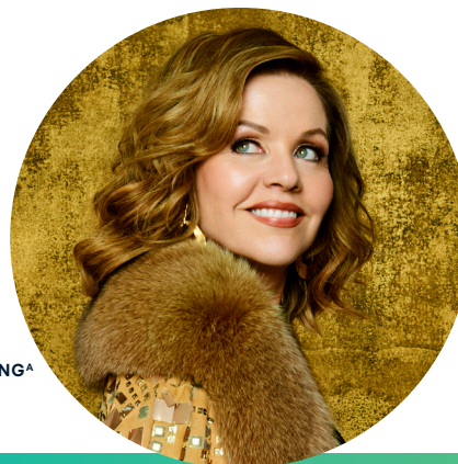
RENÉE FLEMING A

R. SCHUMANN: Symphony No. 4 in D minor, op. 120