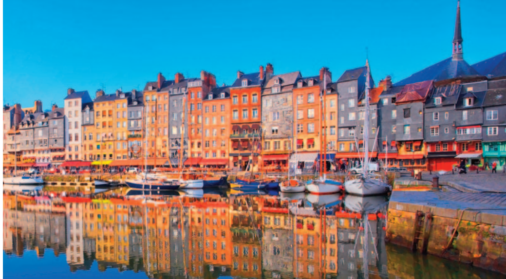
Honfleur harbor, Normandy, France