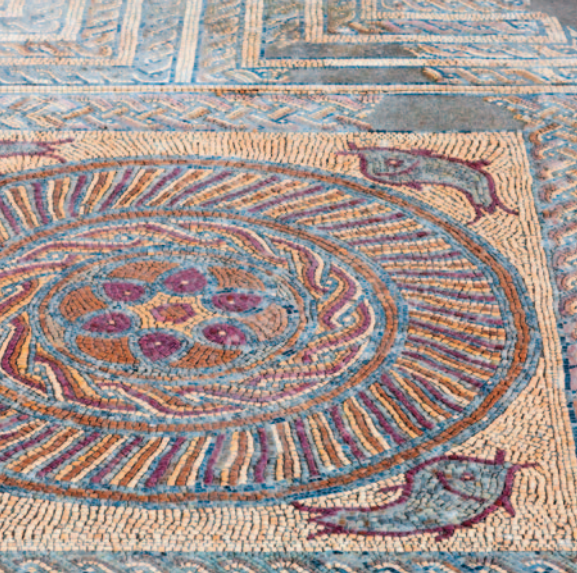
Mosaic from Portugal's ancient Roman site of Conimbriga