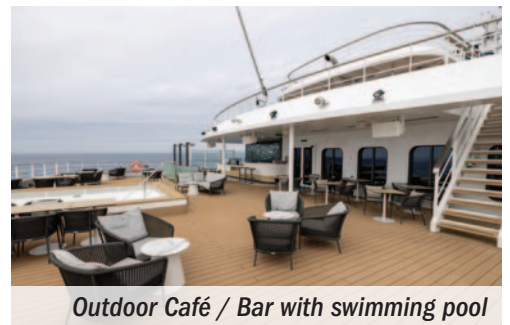
Outdoor Café / Bar with swimming pool

Currently under construction in Finland and launching in early March 2023, Swan Hellenic's Diana is a new-generation expedition cruise ship. Although at 12,100 tons the ship is large enough to accommodate more than 350 passengers, Diana will accommodate a maximum of 192 guests in 96 spacious staterooms and balcony suites. The low guest density results in one of the most generous indoor and outdoor space-to-guest ratios among cruise ships.