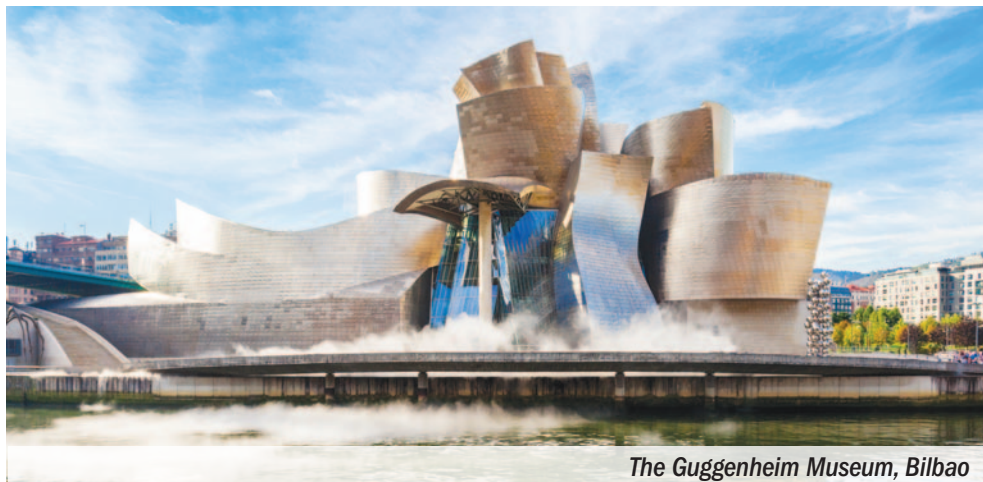
The Guggenheim Museum, Bilbao

After breakfast aboard, disembark and transfer to the airport for flights homeward. (B)