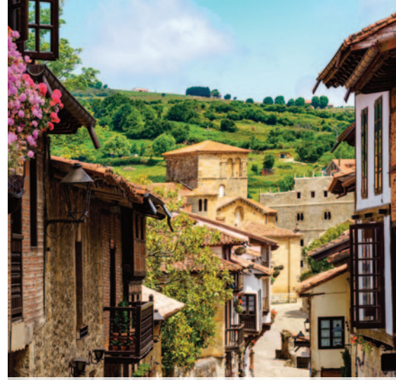
Spain's quaint town of Santillana del Mar