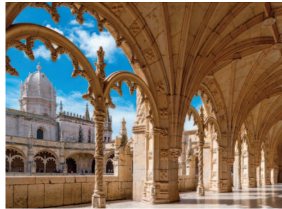
Jerónimos Monastery, Portugal