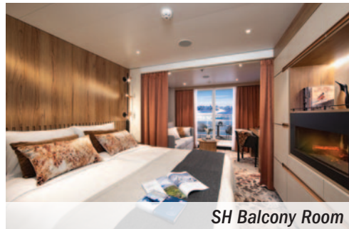
SH Balcony Room