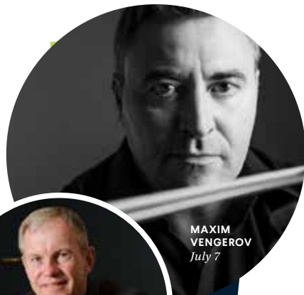
MAXIM VENGEROV July 7