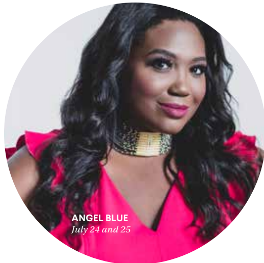
ANGEL BLUE July 24 and 25

Program to include spirituals and works by Holby, Strauss, Arlen, and Gershwin.