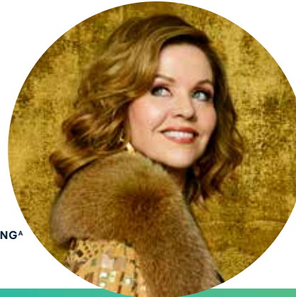
RENÉE FLEMING A

R. SCHUMANN: Symphony No. 4 in D minor, op. 120