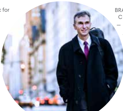
GIL SHAHAM A

BEETHOVEN: Piano Trio in B-flat major, op. 97, "Archduke"