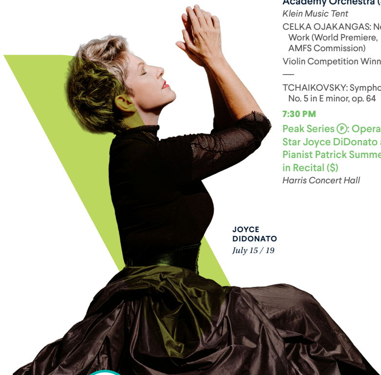
JOYCE DIDONATO July 15 / 19