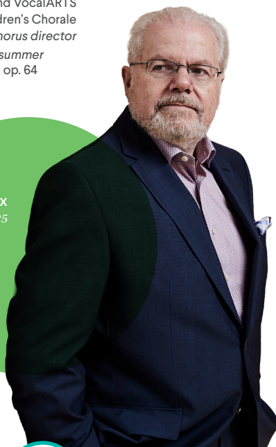
EMANUEL AX July 25

4:00 PM Festival Orchestra: Piano Sensation Daniil Trifonov ($) Klein Music Tent Dima Slobodeniouk conductor Daniil Trifonov piano COPLAND: Quiet City GLAZUNOV: Piano Concerto No. 2 in B minor, op. 100 — VARÈSE: Amériques RAVEL: La valse 7:00 PM Art Song Showcase (Free) Aspen Chapel