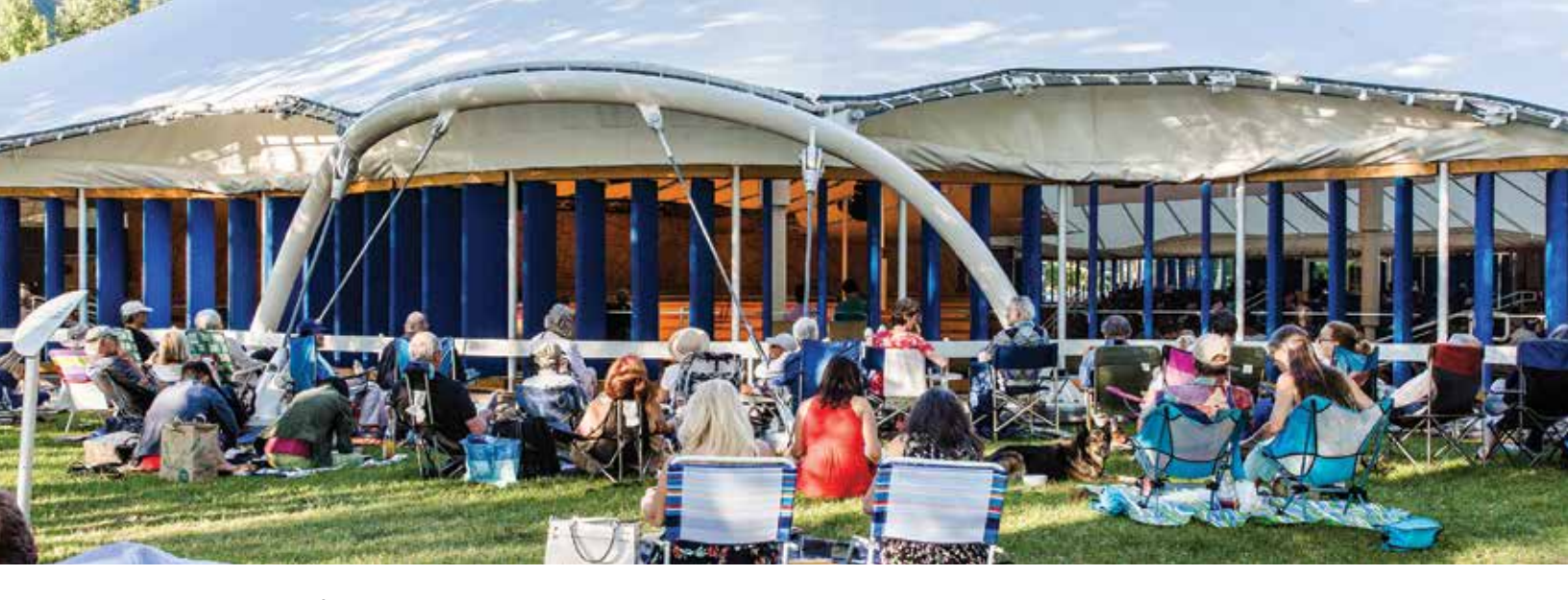
Aspen Music Festival and School 225 Music School Road Aspen, CO 81611